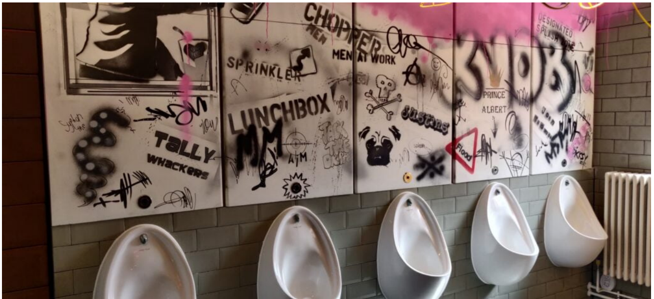
men's toilets with organized graffiti