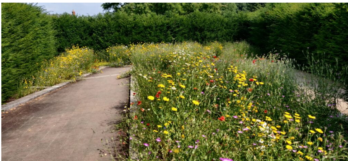
In the Bishops garden

To Wells in the bus. We have a good half hourly service to Bristol from Street via Glastonbury and Wells. The swans were in fine form around the Castle moat. I love the gardens though I am not sure that high summer is the best time. I reckon June, There is too much overgrowth for my liking.