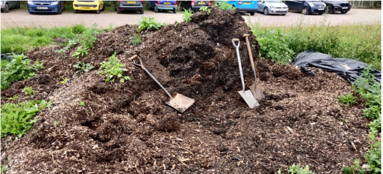
healthy wood chips