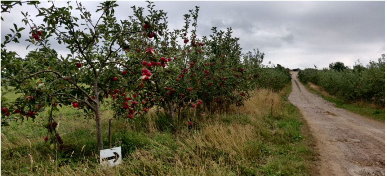
lovely to see such rosy apples so early in the year