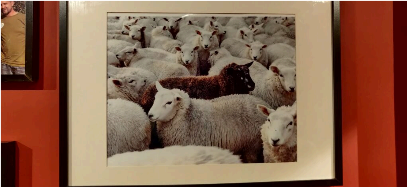
I had the honor to be the black sheep of my family