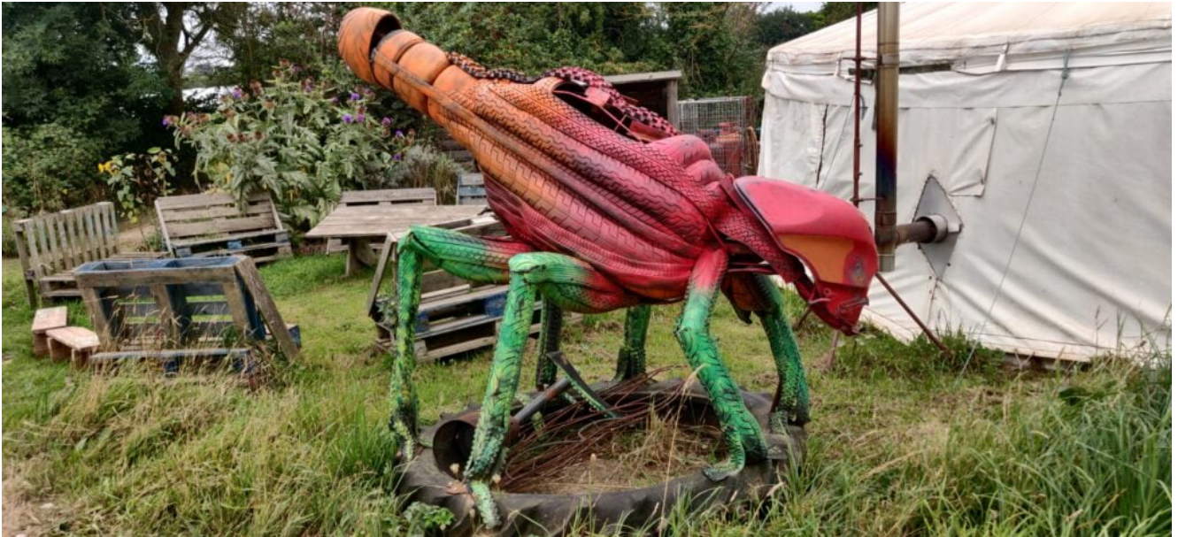
A ferocious locust or alien beast, from a previous music festival, made from recycled tyres