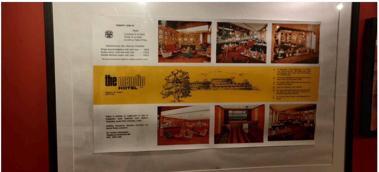
The building in its previous incarnation as a hotel