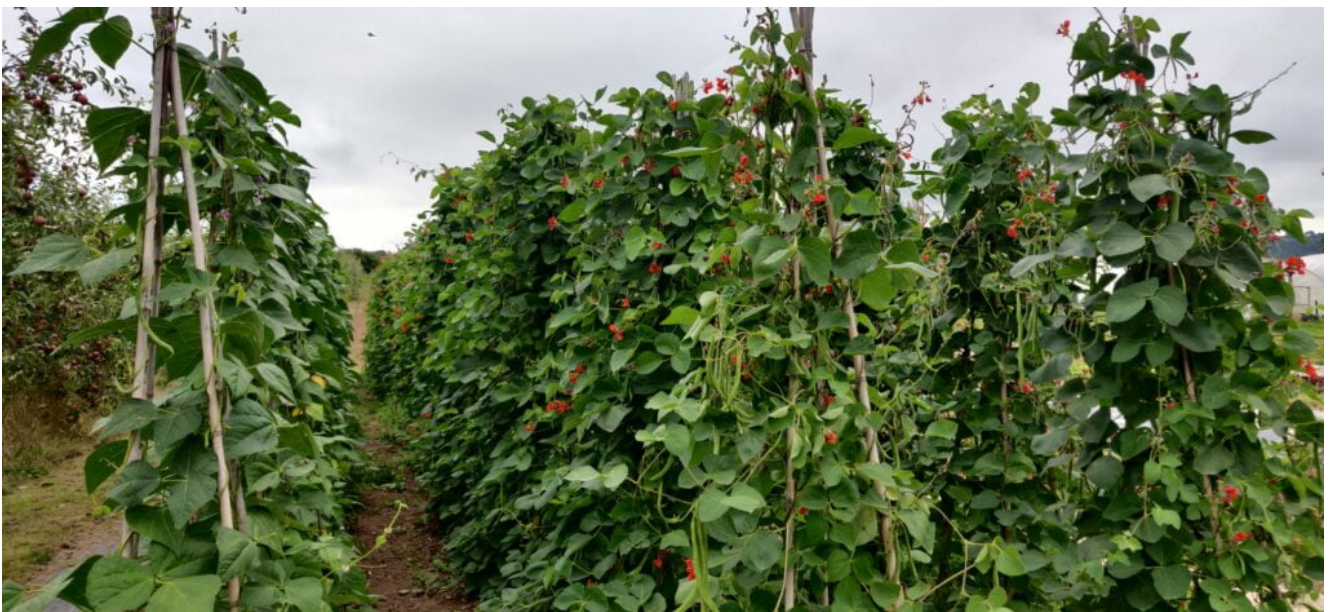
runner beans in all their profligate glory