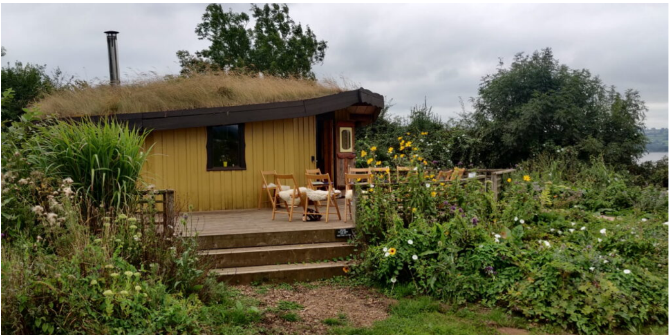
an amazing octagonal kitchen and social area with a grass roof