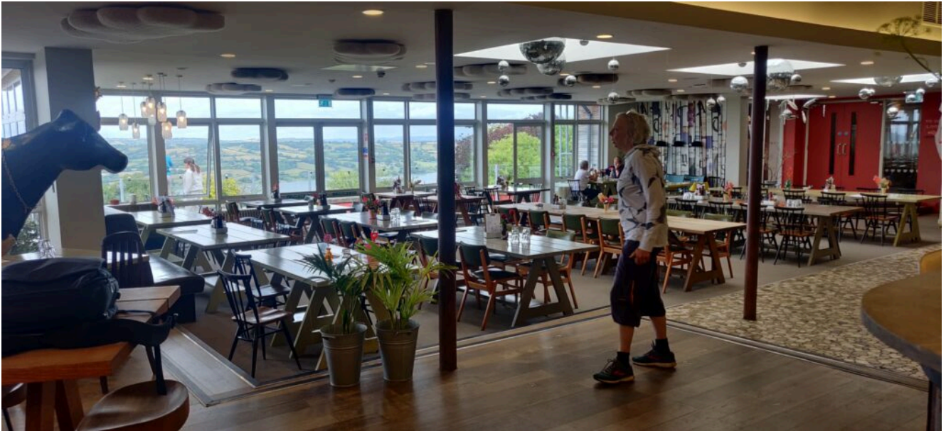
very pleasant dining room