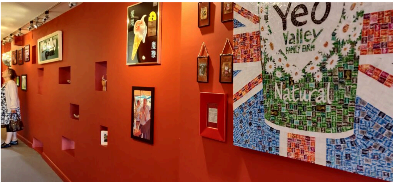
this was a converted hotel