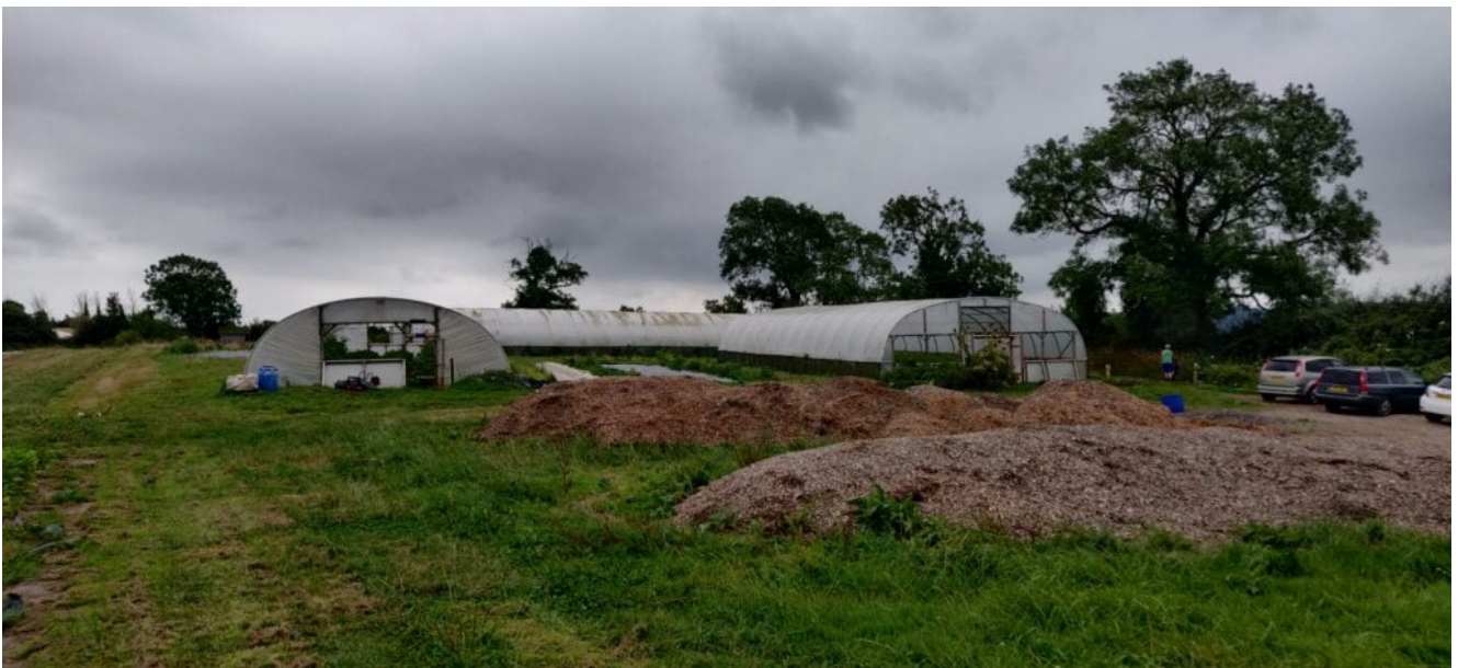
general view – not glamorous but does the job