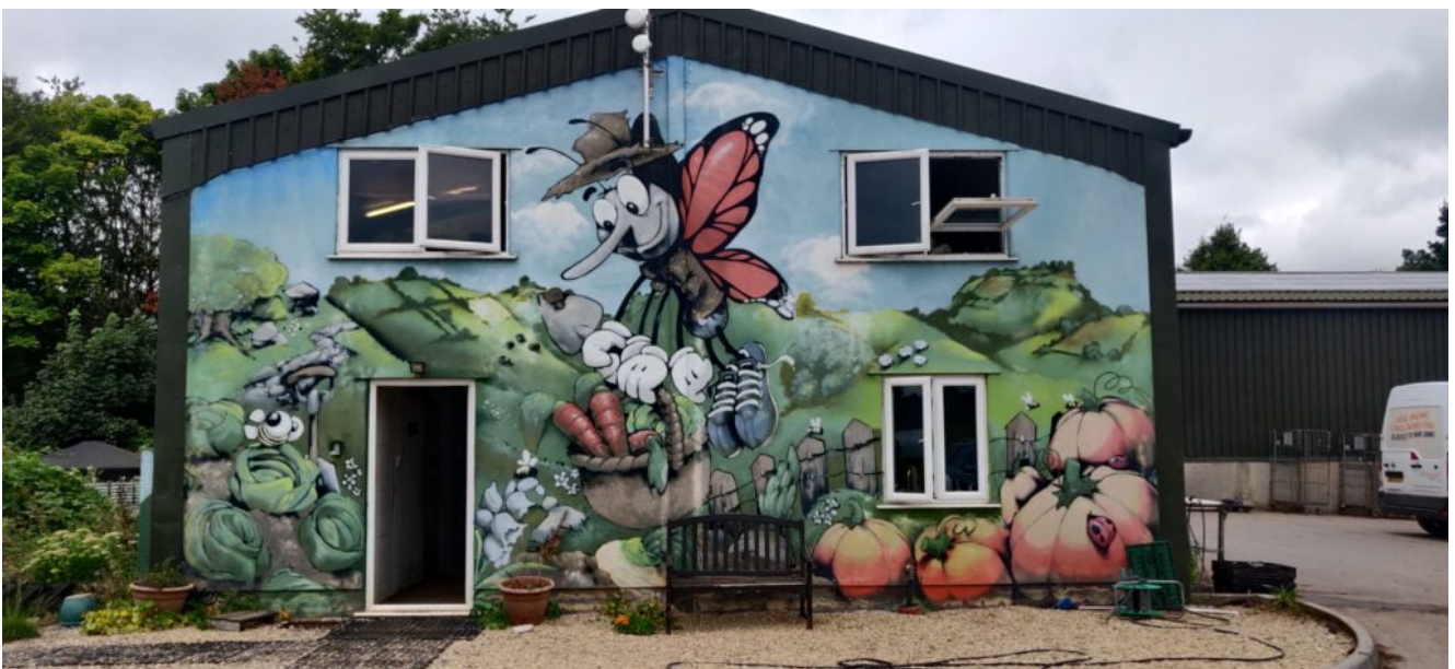
The general admin office