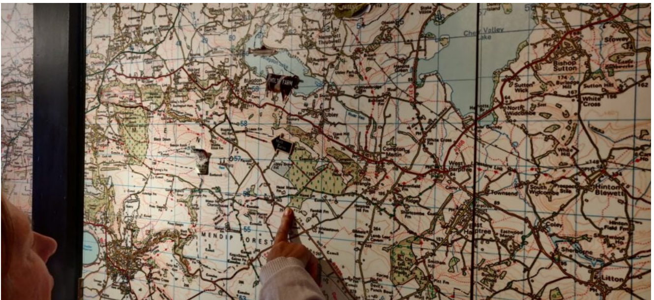
old fashioned Ordnance Survey map