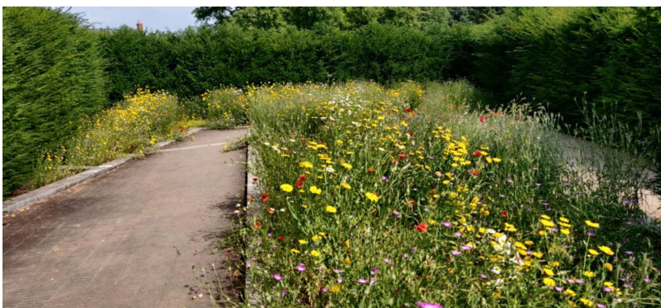
In the Bishops garden

To Wells in the bus. We have a good half hourly service to Bristol from Street via Glastonbury and Wells. The swans were in fine form around the Castle moat. I love the gardens though I am not sure that high summer is the best time. I reckon June, There is too much overgrowth for my liking.