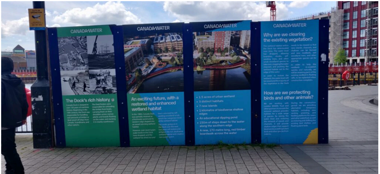
worth reading use Ctrl and the + key to enlarge.