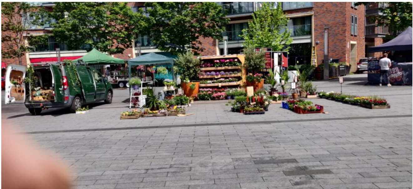
An outdoor plant stall.