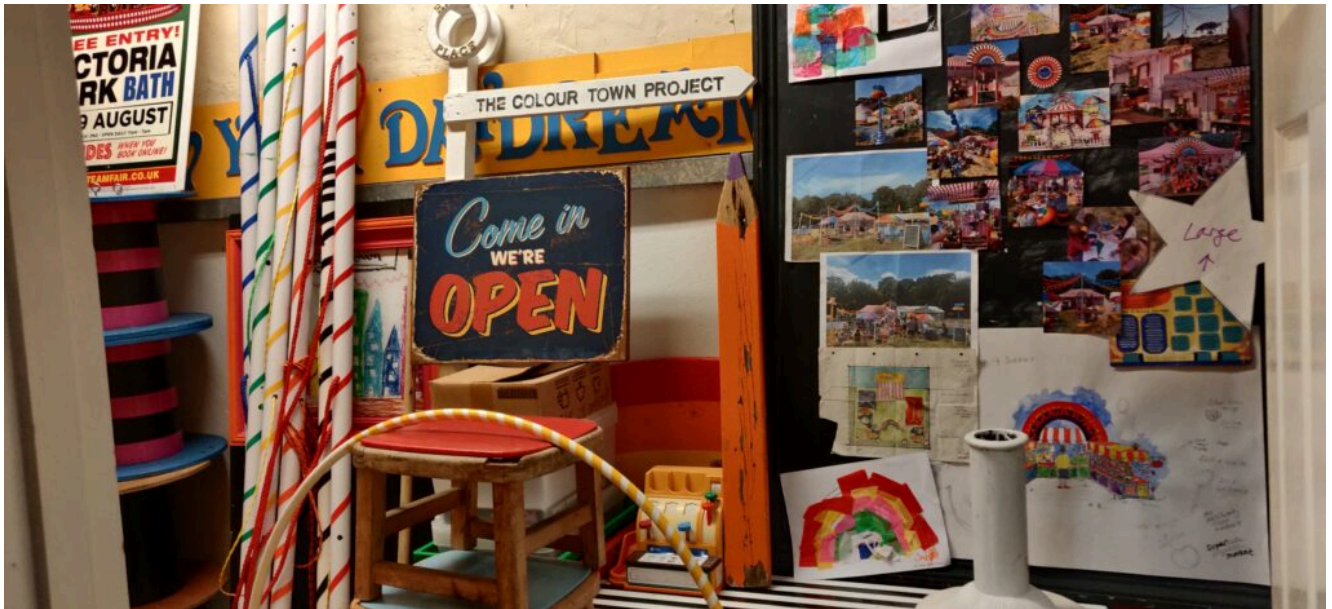
A small sample of her props