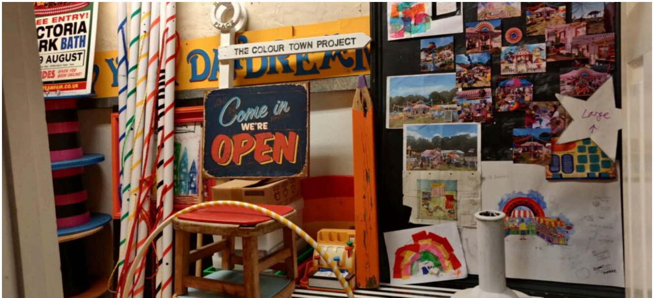
A small sample of her props