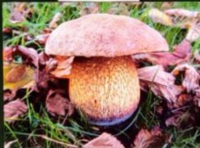
LURID BOLETE Sinclairia lurida