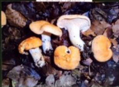
TERRACOTTA INKING Hydnum rubicundum