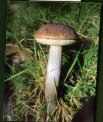
BROWN BETA BOLETE Lactarius stipitatus