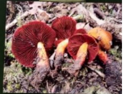
COLUMBAR LYCOP Corthorax columbarum