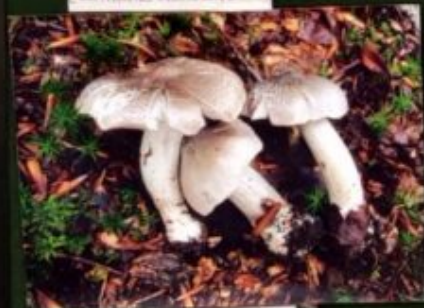
ASHEN KNIGHT Tricholoma equestre