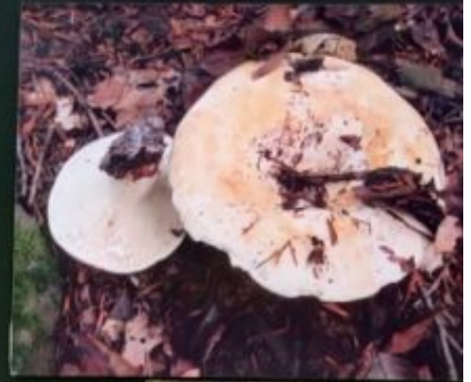
FLEECY MILKCAP Lactaria velutina