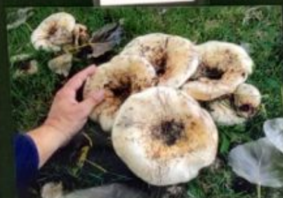
GIANT GILL Lactarius controversus