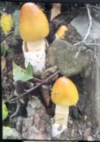
ORANGE GRISETTE Aranta omata