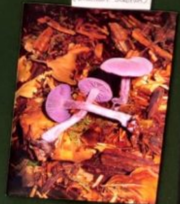
AMETHYST DECEIVER Lactaria amethystina