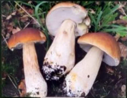
CEP or PENNY BUN Boletus edulis