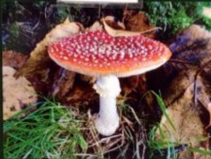
FLY AGARIC Amanita muscaria