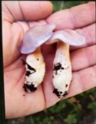
MOBCAP Corthorax cetraceocephalus