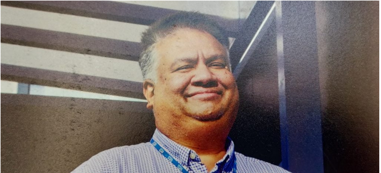
Another happy NHS employee. It looks like he has just stood on dog poo.