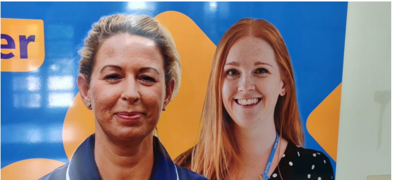
One on the right has a vacuous grin, the other is holding herself together for the shoot. Very much done in haste. Not much good if you cannot see the eye detail.